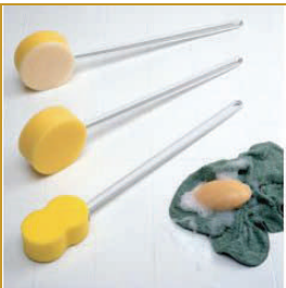
Long Handled Sponges