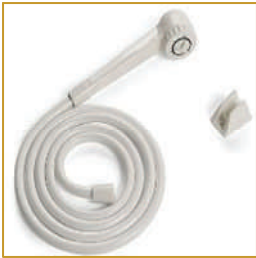
Hand Held Showers