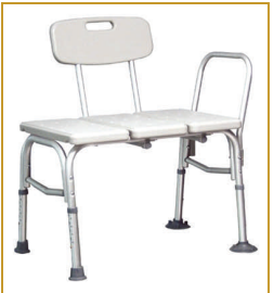
Tub Transfer Benches