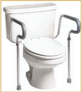
Toilet Safety Rails