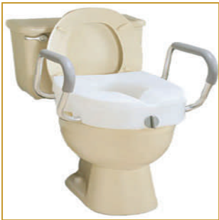
Elevated Toilet Seats with arms