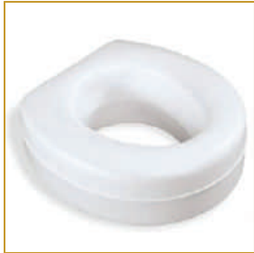
Elevated Toilet Seats