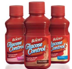
BOOST SNACK SHAKES