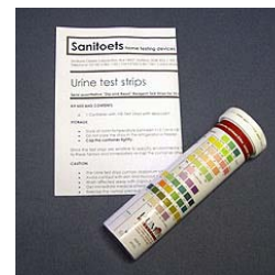
URINE TEST STRIPS