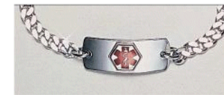
MEDICAL ID BRACELETS