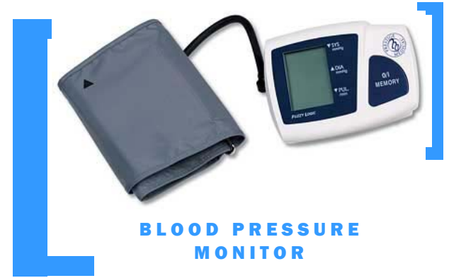
BLOOD PRESSURE MONITOR