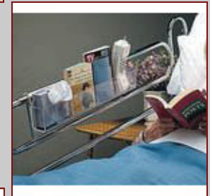
Bed Rail Organizer