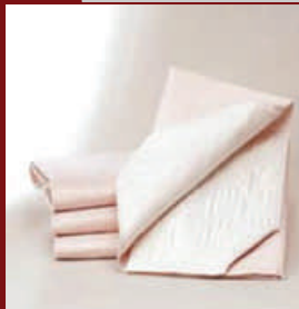
Washable & Disposable Underpads