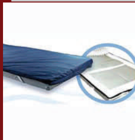
Gel Mattress Overlays