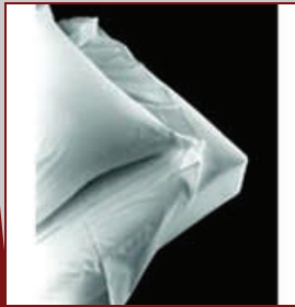
Hospital Bed Sheets