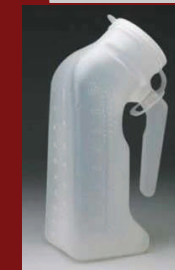
Male & Female Urinals

Helping People Breathe, Sleep & Feel Better