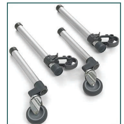
Walker Wheels & Brakes