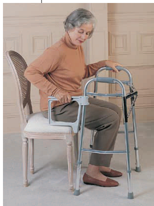
Easy Up Walker Attachments