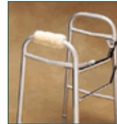
Padded Walker Grips