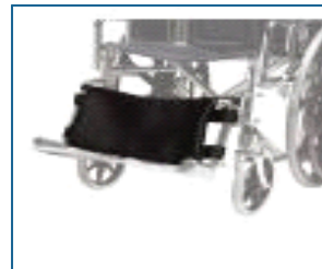
Padded Foot Rests