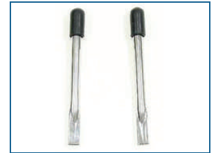
Brake Handle Extensions