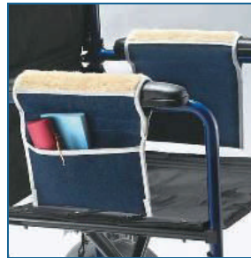
Padded Arm Rests